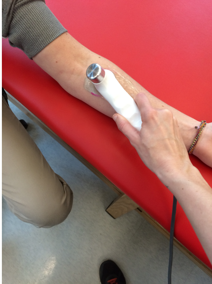
Figure 2. Therapeutic ultrasound

with post-treatment blood flow measurements immediately, 5 and 10 minutes following the end of the treatment.